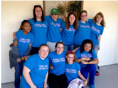
Young Ladies Latching Arms Group