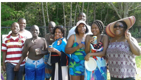
Haitian Family Group Summer Picnic

Family Support coordinators are fluent in Portuguese, Cape Verdean creole, French, and Haitian creole. We also speak Spanish! As needed, we arrange for translation and interpretation in other languages.