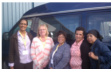
BAArc Parents Attend Transition Conference